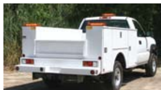
Shown with multiple HighLighter LED mini-lightbars mounted on a box truck.

* Total amp draw depends upon flash pattern used.