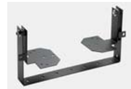
HIGHLIGHTER LED self-leveling bracket option.