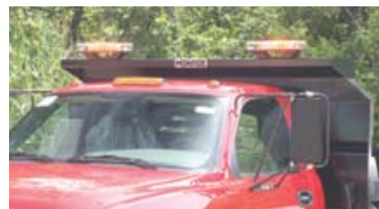
HIGHLIGHTER LED shown with riser mount kit option.

The compact HIGHLIGHTER LED mini-lightbar measures a mere 2.7 inches high (permanent mount) making it ideal for amber, police, and fire applications that place a premium on space savings. The HIGHLIGHTER LED is available in permanent, magnetic, suction-cup magnetic mounts, and a variety of other custom mounting options. All HIGHLIGHTER LED models meet SAE J845, Class 1 specifications.