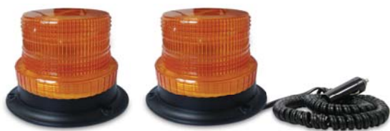
JB130L Permanent mount