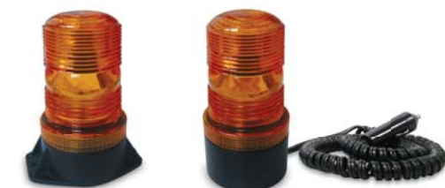
JB106L Permanent mount